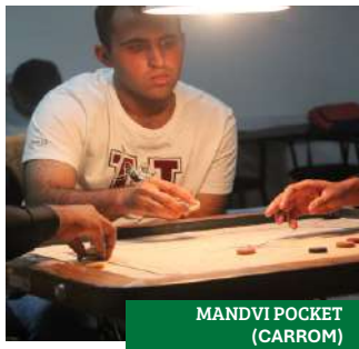
MANDVI POCKET (CARROM)