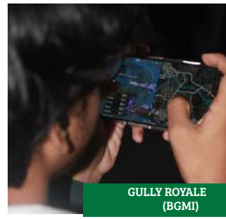
GULLY ROYALE (BGMI)