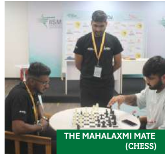
THE MAHALAXMI MATE (CHESS)