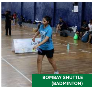
BOMBAY SHUTTLE (BADMINTON)