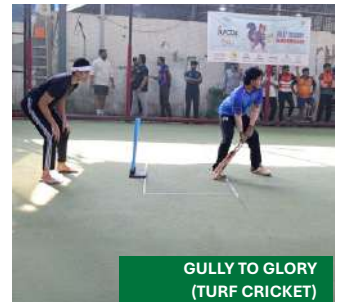
GULLY TO GLORY (TURF CRICKET)