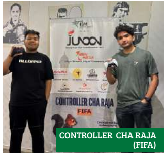
CONTROLLER CHA RAJA (FIFA)