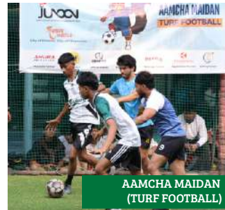
AAMCHA MAIDAN (TURF FOOTBALL)