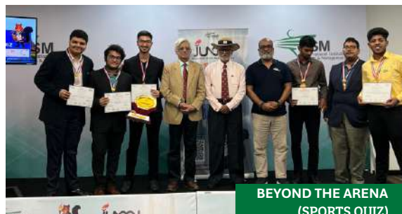
BEYOND THE ARENA (SPORTS QUIZ)