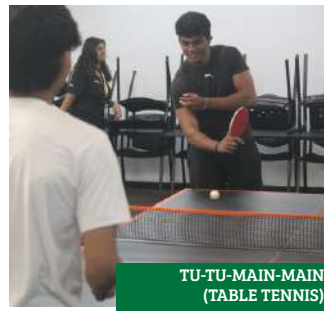
TU-TU-MAIN-MAIN (TABLE TENNIS)