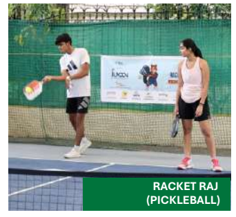
RACKET RAJ (PICKLEBALL)